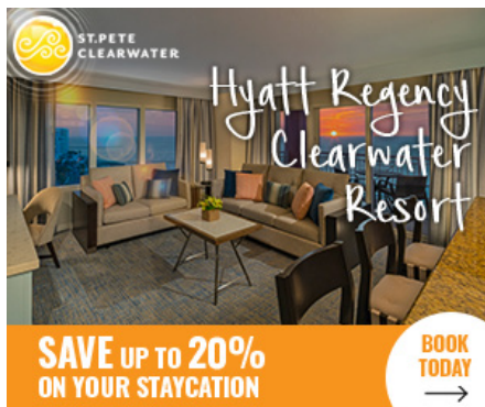
Sample creative. Actual creative may vary.